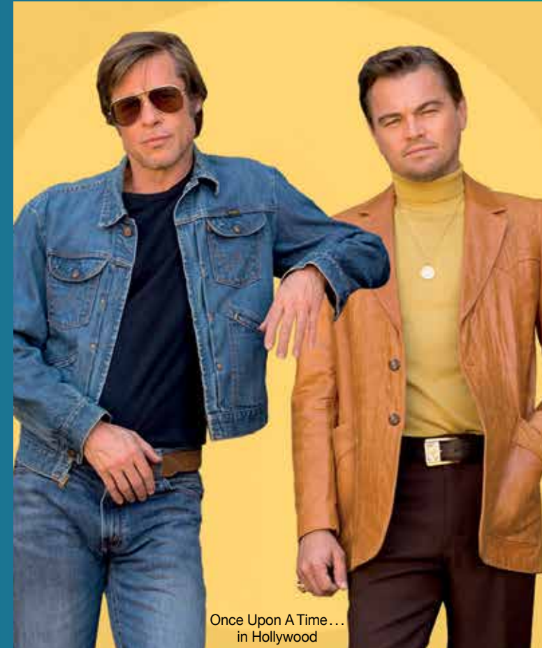
Once Upon A Time... in Hollywood