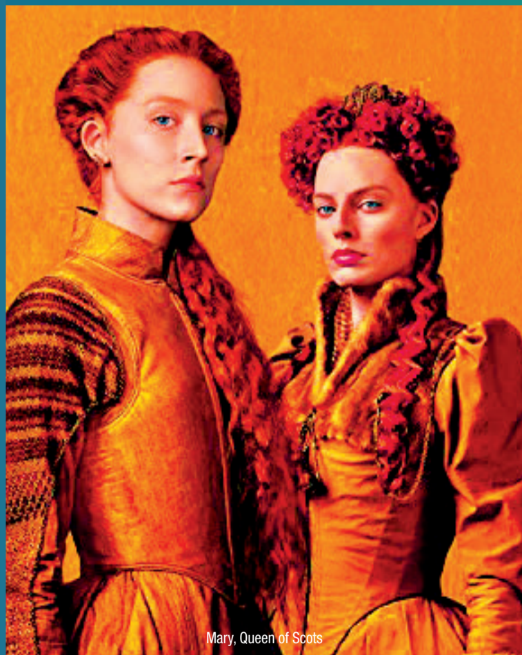
Mary, Queen of Scots