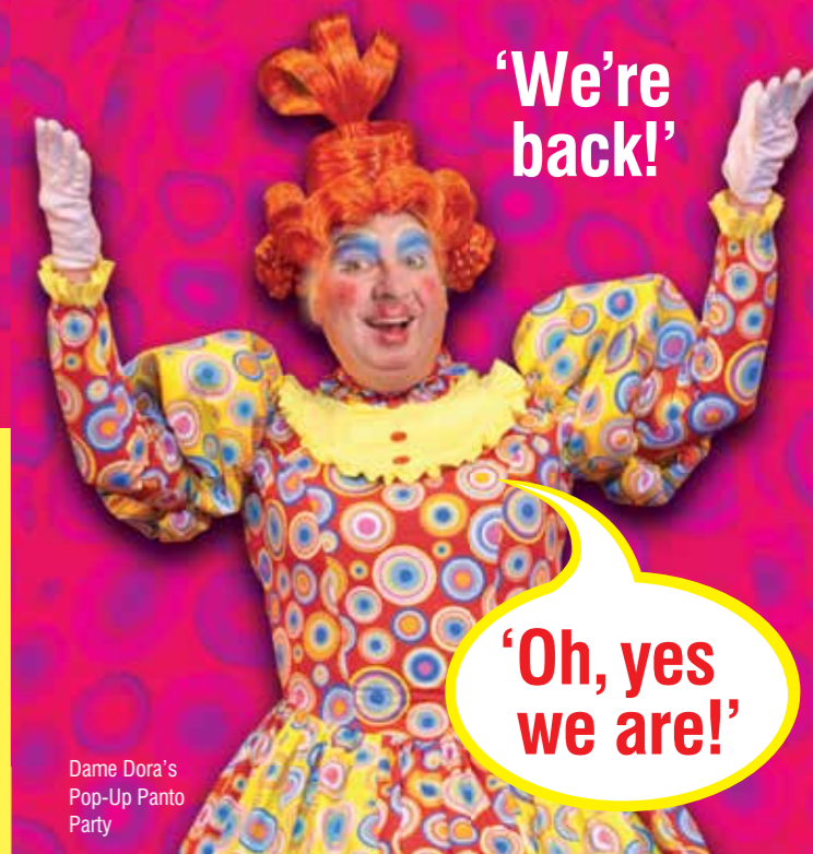
Dame Dora's Pop-Up Panto Party