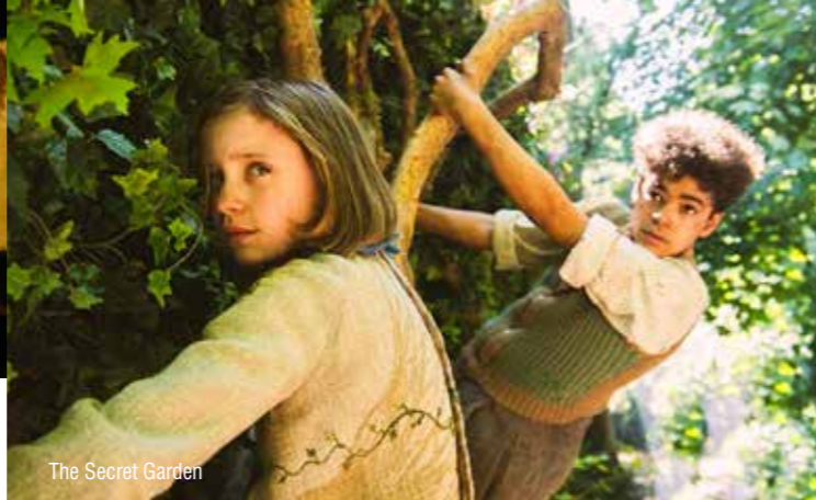
The Secret Garden